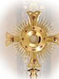
O Sacrament Most Holy

The presence of Christ in the Eucharistic celebration and in the Blessed Sacrament is viewed by many as the 'jewel in the Crown' of Catholicism. The Gospel presents us with an important text on which our belief in the 'real presence' is founded. In John chapter 6 we read what has become known as 'the Bread of Life discourse.' Here, Jesus tells us that his flesh is real food and his blood real drink; he is the bread come down from heaven. To be in communion with Christ is to be in communion with life. O Sacrament most holy, O Sacrament divine, all praise and all thanksgiving be every moment thine.